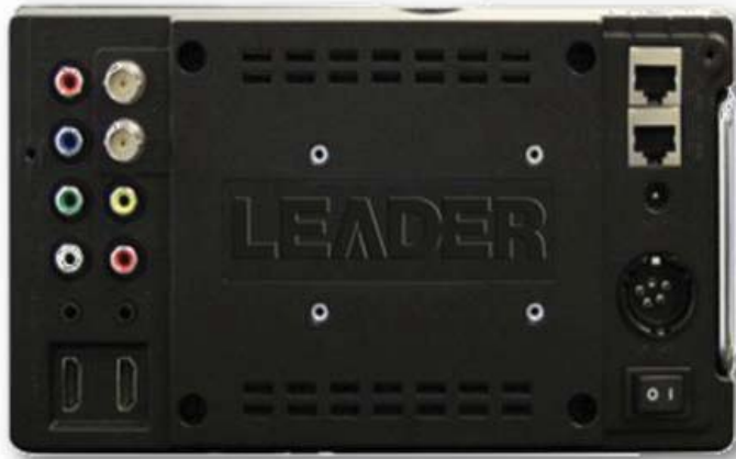
LV5307 Rear Panel with Available Connections