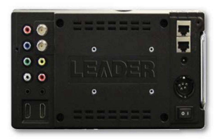
LV5307 Rear Panel with Available Connections