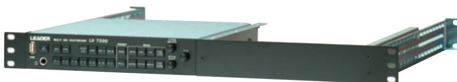
LR 2481 Rack Mount Adapter (sold separately)